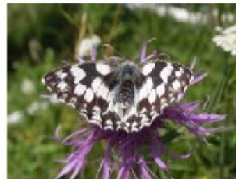
Marbled White butterfly