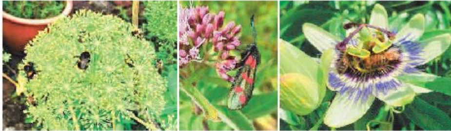
Bumblebees on Angelica