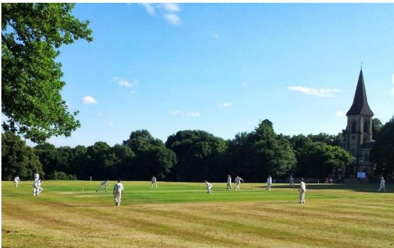
Southborough Common – 13 June walk

Our friendly group is one of 13 Ramblers groups in Kent and part of the national Ramblers walking organisation. We explore the beautiful countryside of Tonbridge and Malling and surrounding areas.